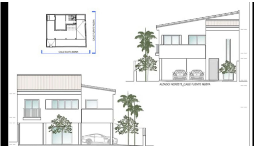
CUADRO DE SUPERFICIES